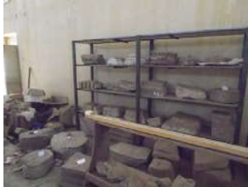
Fig.28 – The store in the Museum with some architectural elements from the Italian Excavations.

most important materials in the Museum of Karima; 15 such a structure is fundamental for our work, granting a safe room for the storing of the most precious objects unearthed in the site. For a long time the archaeological materials have been stored there; in the last years, some more architectural elements have been stored in a room annexed to the Museum exhibition (fig.28). 16