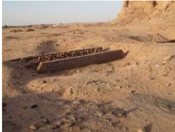
Fig.16 – Part of the restorations undertaken in the peripheral wall of the Natakamani's palace (B1500).

the site. Thanks to a year-by-year check of the edifices, in order to leave on the ground the profile of the excavated structures, we can now recognize the quite complete perimeter of the palace B1500, which marks with its impressive platform all the area of Meroitic Napata. Such a restoration is also the result of a regular planning of the activities on field, in order to tie together in a single net the new digging, and the preservation of what has been already investigated (fig.16).