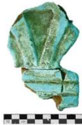
Fig.1 – Fragment of a glazed tiles, reproducing a s3 -sign.