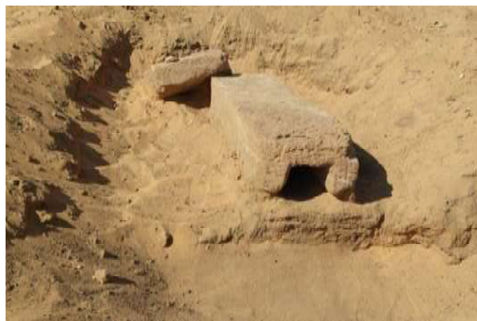
Fig.17 – The two fragments of the hydraulic pipe unearthed E of B2300.

During the last days of the season, a survey was undertaken in the area east of the main field; here, a massive stone was visible on the surface, and its proximity to the building B2300 let the team suppose a probable connection with it. The cleaning of the area unearthed part of an hydraulic pipe hewn in two sandstone blocks, perfectly covered with an hard plaster (fig.17). 13 Such a pipe is probably part of a hydraulic system, which was hypothesized since the excavations in the Edifice of the Basins (B2200); its presence could confirm the role of the water in some part of the royal district planned by Natakamani, which became the screenplay for specific performances connected with the new water of the flood and the kingship.