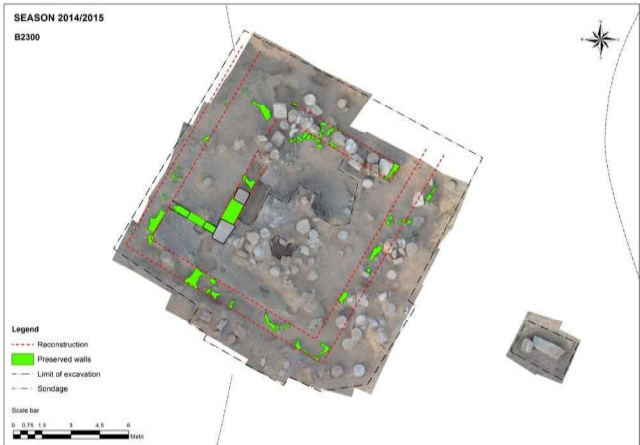
Fig.5 – Preliminary plan of B2300, according to the data of the season 2014-2015.

at W of the southern basement in the inner foundations could be a threshold of the corridor, which surrounded the kiosk in the western side (fig.6). The current information does not allow us to reconstruct the extent of the building, which needs a careful investigation in the next season. A starting point for the incoming diggings would be the central part of the kiosk: here, during the last days of the season, few remains of a mud brick wall were identified in the central part of the building, under a massive layer of bread moulds (fig.7). What are these could actually be difficult to say now, but they fit in with the architectural core of the inner building.