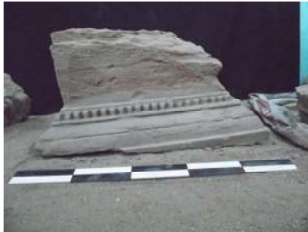
Fig.18 – The sandstone base with a denticulated moulding.

Despite the short length of the full excavations, the results of the archaeological material are extraordinary: surely, the architectural elements are the most impressive typology of finds dug during the season, but we can also mention other items, which were part of the ancient equipment. One of the most characterizing objects is a sandstone base, whose style repeats some patterns already recognized in the denticulated moulding cornices (fig.18). Its original location in B2300 is not clear, 15 but we might suppose that it decorated the area near the main entrance of the building.